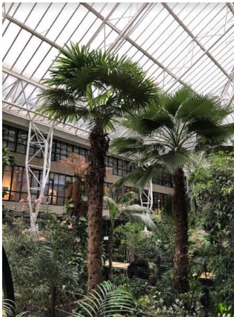
Barbican Centre, Palms, 2019