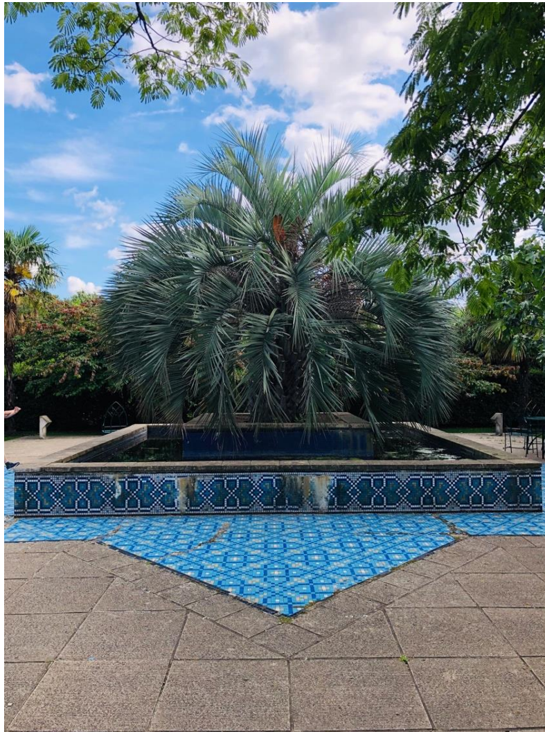
True date Palm Tree, Burgess Park, Islamic Garden, 2019