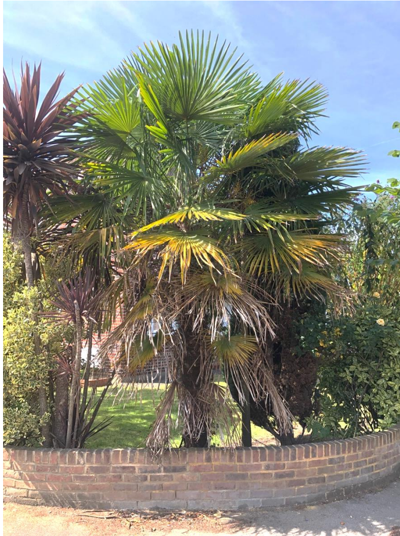
Palm tree in Wimbledon, suburban garden, 2019