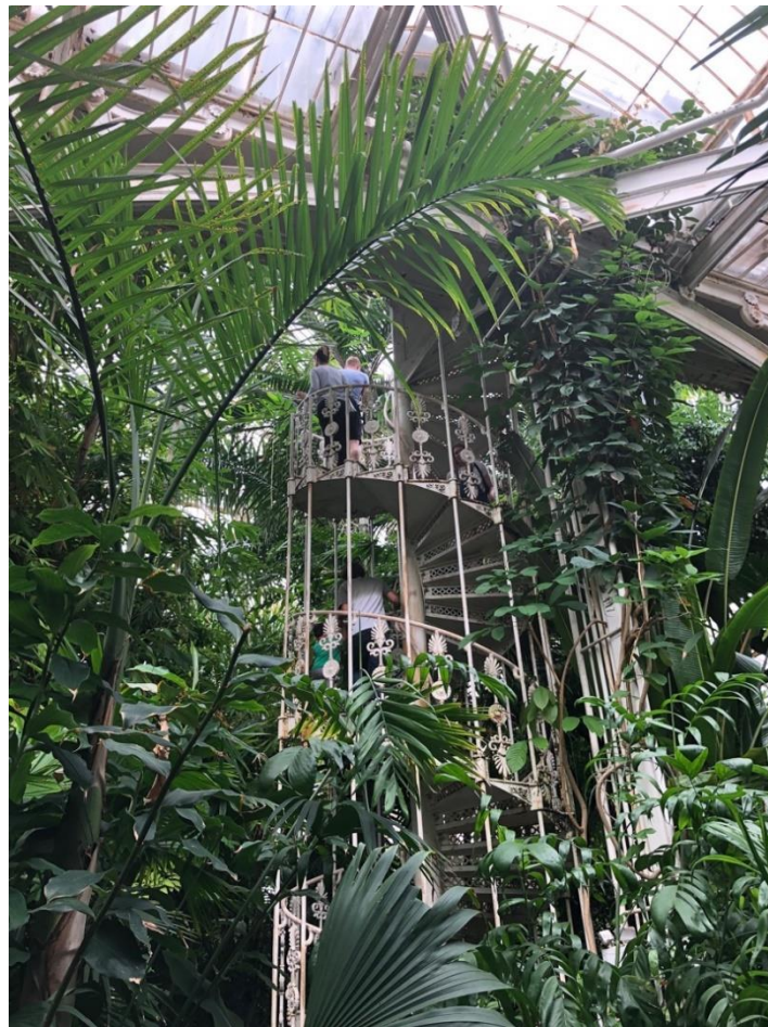
Palm House, Kew Gardens, London, 2019

successful uprooted-ness: synonymous with tropical views, pre-lapsarian lands, and exotic holidays.