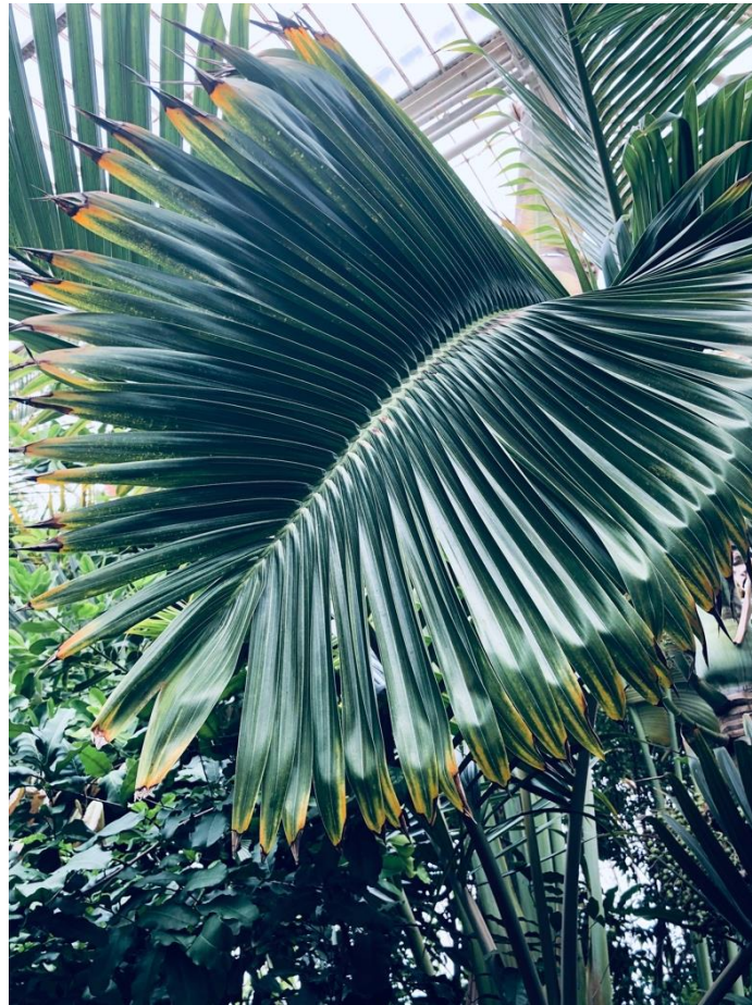
Palm Fronds- palmata, Palm house, Kew Gardens