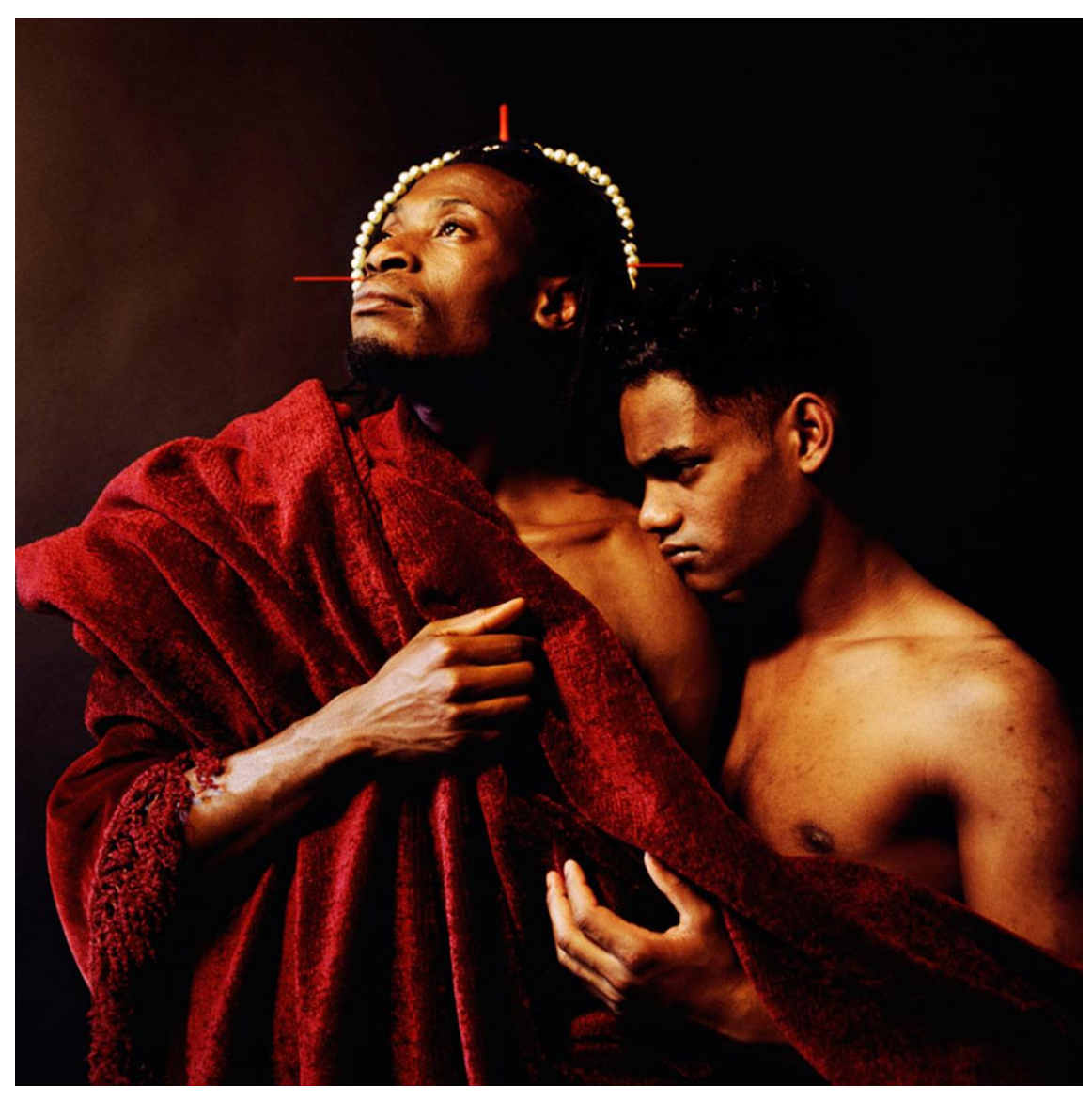
Figure 3 : Rotimi Fani-Kayode, Every Moment Counts , 1989.

This imaginary distortion around the African continent is largely due to the education system set up in Africa by the West, as Fani-Kayode puts it: