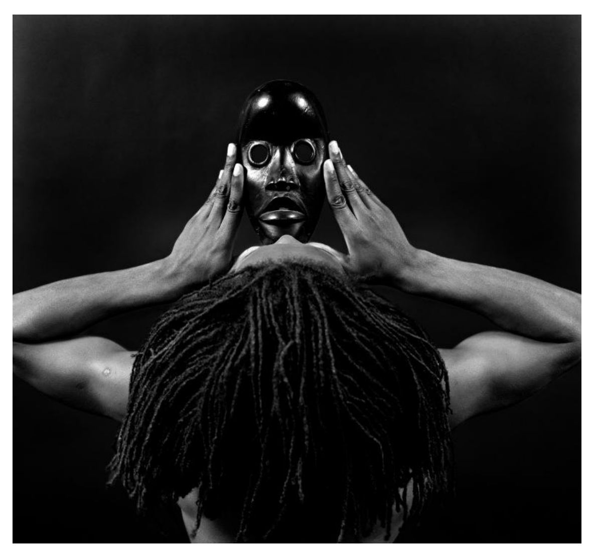
Figure 2: Rotimi Fani-Kayode, Dan Mask , 1989.

The freedom of bodies in their exposure, materiality and plasticity distances them from fetish and hyper sexualization, from the control and freezing of bodies, endowing them with their own domain, beyond erotic desire. The helplessness of those who contemplate them, when with masks, for example, puts the viewer in a distant terrain of Cubist primitivism, forcing them to build another reading of the bodies that face them.