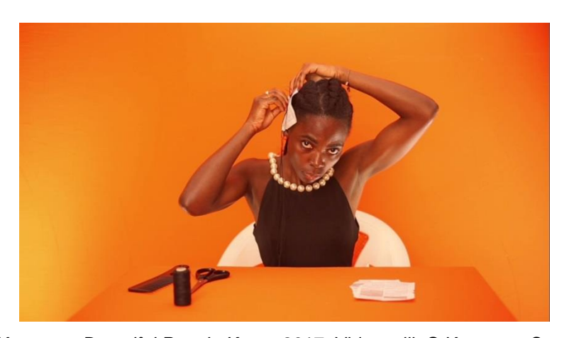
Figure 8: Keyezua, Beautiful People Know, 2017. Video still. © Keyezua. Courtesy of the artist and Movart, Luanda.

disrupting blackface.<sup>29</sup> In her video Keyezua examines the violence of stereotypes around black hair and asserts black beauty. She films a black young woman combing and braiding her hair slowly, in a long ritual of hair care that includes sewing book pages of "wisdom and awareness" into her hair (Keyezua Atelier, 2017). The hair braiding and page sewing become somewhat ambivalent gestures, both hiding and protecting the natural hair. In fact, braiding and sewing can simultaneously evoke hurt and care, pain and repair. The book pages are sewn only to be crumpled into hair buns and then reflattened, uncovering and re-covering the braided hair with wise words of awareness. The artist thus addresses the psychic wound arising from the alienating desire for an always frustrated social acceptance by white standards, and the healing opened up by the political awakening contained in words and gestures, both individual and communal. Which wise words are these?