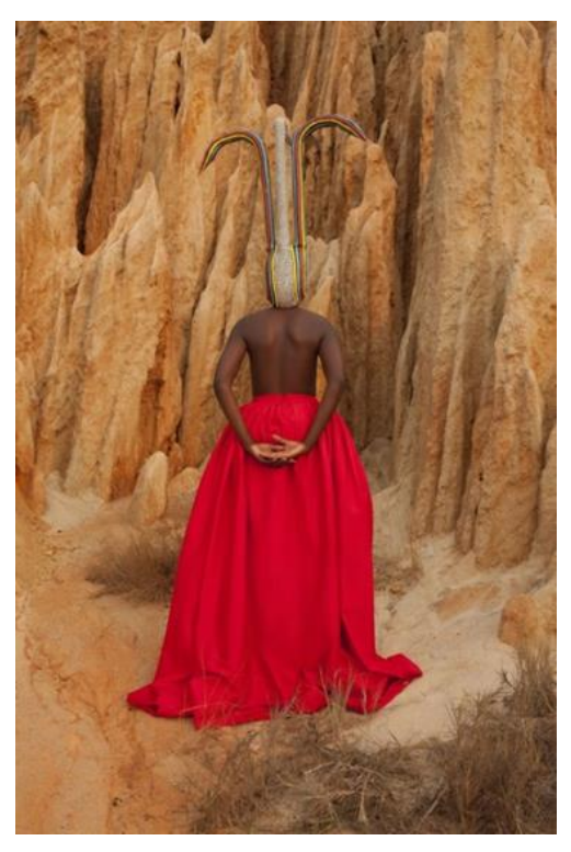
Figure 9: Keyezua, Fortia (11) , 2017. From the series Fortia , 2017. Giclée print on diasec mount, 118.9 x 84.5 cm.

progressively learns by looking carefully at the images and by reading the accompanying text, the series remains poetically open to broader readings on black female and male beauty and strength, and to non-normative conceptions of gender and sexuality.