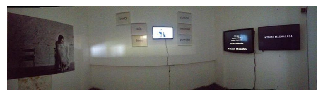
Figure 5: Eurídice Kala aka Zaituna Kala, Imagine if Truth was a Woman... And Why Not? , 2016. Installation view, 12<sup>th</sup> Dakar Biennial, Dakar, 2016.