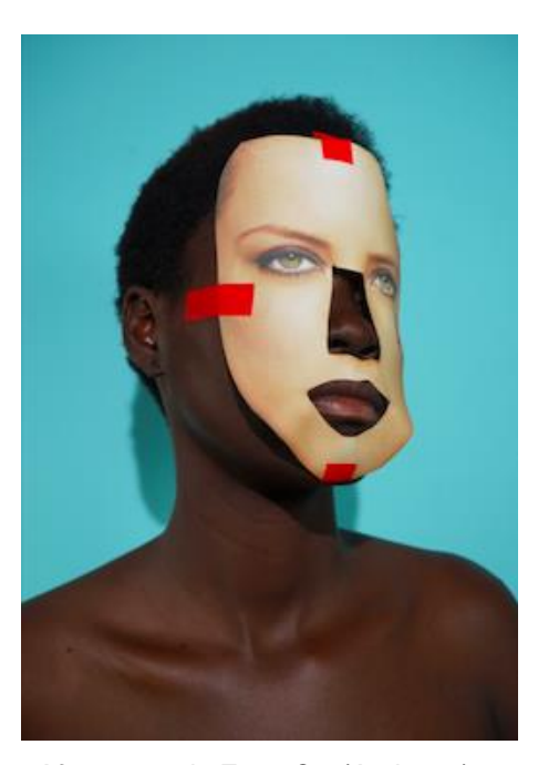
Figure 7: Keyezua, Afroeucentric Face On (Amber 4), 2016. From the series Afroeucentric Face On, 2016. Giclée print on fine art paper, variable dimensions. © Keyezua. Courtesy of the artist and Movart, Luanda.

Kardashian, were considered the most beautiful, the artist came up with a photographic and performative strategy to counter such a narrative by mimicking and mocking the plastic surgery face cutting. While, at first, the masks of these white female celebrities completely cover black female faces, in Keyezua's series the black skin progressively emerges through the cutting of the white masks (Fanon, 2008; Mama, 1995). The removed pieces are precisely those that pseudo-medical science has apparently deemed essential for female facial perfection: fine lips and noses, thus eclipsed to make way for black beauty. Like Kala, Keyezua reinforces whiteness visually only to disrupt it more powerfully.