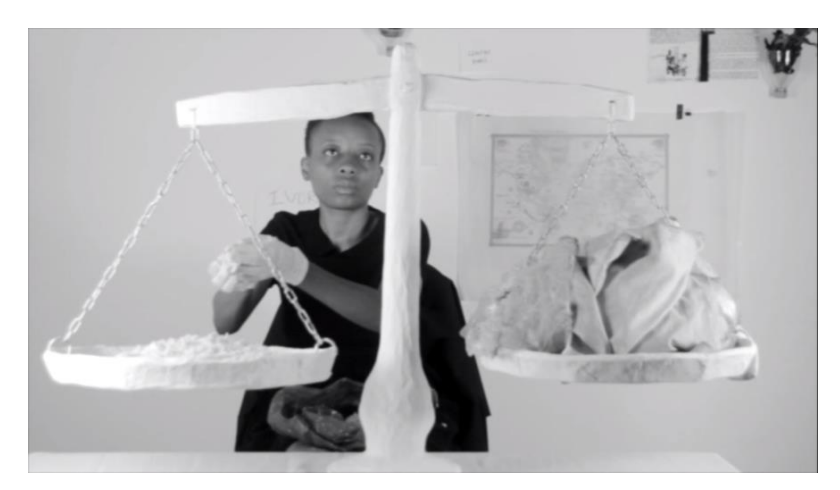
Figure 4: Eurídice Kala aka Zaituna Kala, Measuring Blackness and A Guide to Many Other Industries , 2016. Video still.

behind her, is substituted with paper), salt, bone (made from candle wax), coconut, cotton, and plaster powder (used in construction).<sup>23</sup>