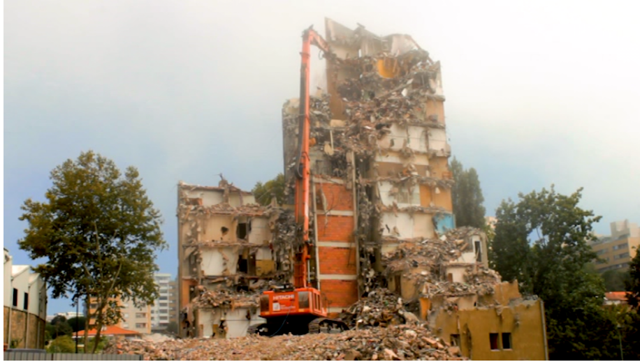
Figure 7: Demolition of Tower 2 in the Bairro do Aleixo, 2019

The processes of removal and relocation are intrinsically delicate and complex. Few things could be more traumatic than being dispossessed of your home against your will. In the case of Aleixo, perhaps because of all the stigma associated with the place, relocation proved prolonged and distressing, as documented by newspapers of the time 11 . Before the demolition, the neighbourhood was in a kind of limbo, waiting for the end, with the buildings nearly empty and more vulnerable to security risks. Neglect from municipal authorities left the remaining towers in disrepair. Malfunctioning elevators (whose operation over the years seems to have been intermittent) compounded the challenge of relocating people and their belongings 12 . It should be noted that this degradation was among the motives behind the demolition and that the failure to curb the rise in safety and health risks of the space only strengthened public support for the decision.