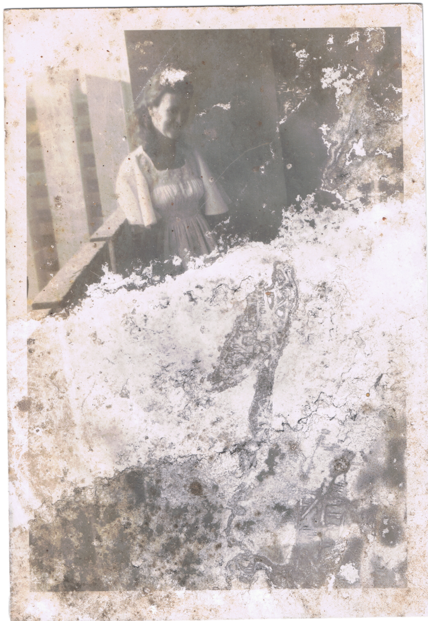
Figure 1: Front of the photograph found.