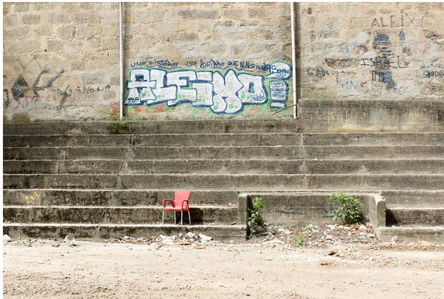
Figure 5: The graffiti scrawled on a weathered wall in the neighbourhood reads: "Aleixo always/a history, a neighbourhood that never ends"

Has the image, then, acquired punctum , that sharp element whose mere presence "interrupts my reading" (Barthes, 1980/1984, p. 67) of the photographer's general framework of intentions 9 ? At first glance, considering that the punctum is the detail that "wounds" the image, one might think that it is the stain that literally corrodes the lower part of the photograph. The stain brings to the surface of the image all the episodes of violence that have played a part in the constitution of the neighbourhood since its inception. It remains like a scar inflicted on the photograph by the demolition, the latter also being "a wound, not only in space, but also in the body of time" (Raqs Media Collective, 2011, para. 3). It also alludes to the persistent stigma that hurts the reputation of the place and its residents. Otherwise, one could also consider the punctum as the black abyss of the woman's eyes or the light sleeves of the dress emptied from her arms (in a Warburgian reading, would this be a pathosformel , an accidental emergence of the classical formula, of the Venus de Milo?). However, Barthes (1980/1984) also speaks of another type of punctum , which is not a detail and which seems to be what particularly "pricks me (but also bruises, is poignant to me)" (p. 46):