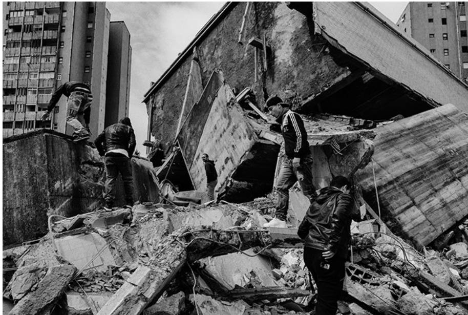
Figure 9: Boys walk through the rubble of Tower 4 after its implosion, 2013

Gordillo's (2014) observation is illustrated both by the circumstances of my encounter with the photograph and by the records of Tower 4's implosion (Figure 9). These attest to the invasion of the newly produced rubble by a group of people, mostly residents, as a form of protest against the destruction (Lusa, 2013).