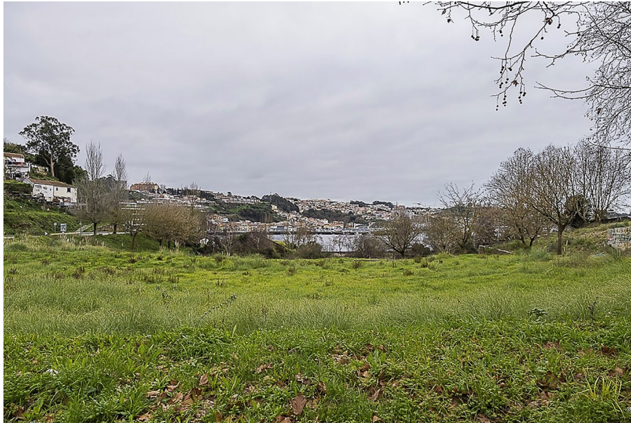
Figure 4: The location where the former Bairro do Aleixo once stood after the complex was demolished, 2022