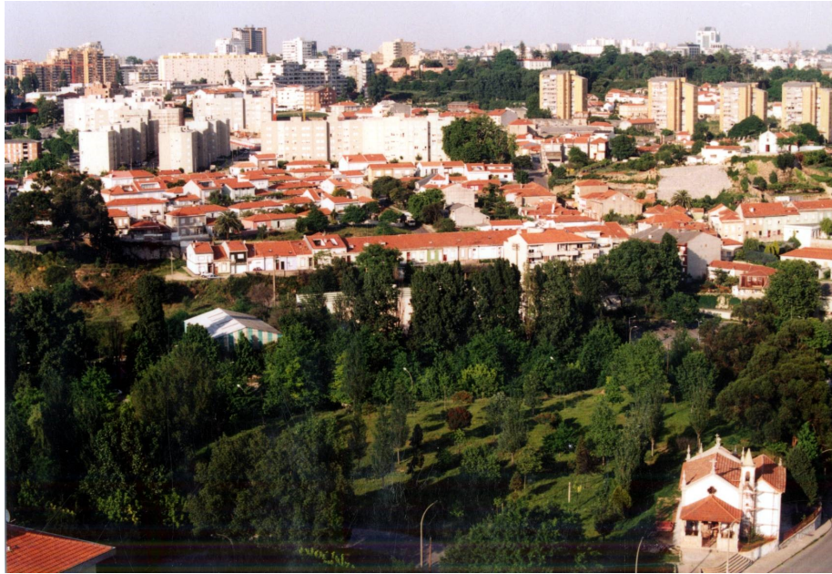
Figure 8: Panoramic view of Campo Alegre, captured from a tower in Pasteleira . The towers of the Bairro do Aleixo are visible at a distance, in the upper right-hand corner, 2000

an abstract construction shot not yet defiled by the arrival of the residents.