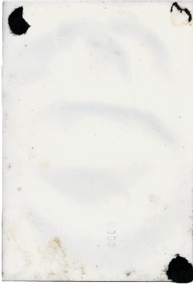
Figure 2: Back of the photograph found.

The gloom inside the flat veils the front of her face, while the outside light illuminates the right side. She is wearing a white summer dress of light translucent fabric and flowing sleeves. Her arms remain concealed, maybe crossed behind her body, seemingly shy and hidden from the camera's view. We might consider that each photograph embodies a kind of ruin, carrying remnants of what was left behind into the present. In this one, however, the ruin seems integral to the very constitution of the image. Brown spots resembling grains of earth dot the print's surface. Its lower half, faded and corroded, remains a mystery. It has been invaded by an oxidised crust that can be attributed to time but also to the period it spent among the rubble, possibly exposed to rain and humidity. It is