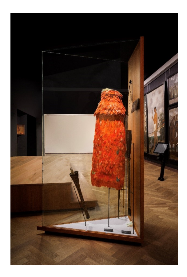
Figure 1: Tupinambá cloak in the Nationalmuseet, Denmark (2021)

Following confidential negotiations, the Nationalmuseet announced the restitution through an official statement, highlighting that the donation represents a singular and substantial contribution to the restoration of the Brazilian museum's collection, which had suffered extensive damage during a major fire in 2018.